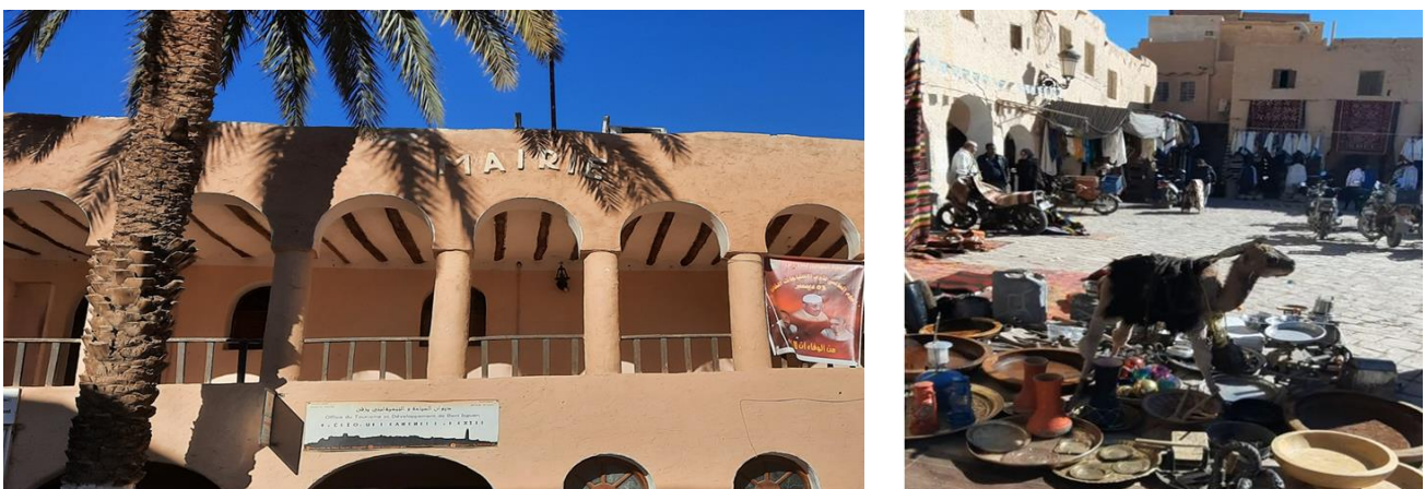
Figure 3. Left: Office of Tourism and Development Beni Isguen. Right: traditional marketplace at ksar Ghardaia.

There are also some organized tours to the oasis while the visitors can explore the palm grove, summer dwellings of Mozabites, and the traditional irrigation system of the settlement. During the tours, the guide gives a historical overview of Mozabite architecture, culture, and traditions, and answers all the tourists' questions as well. Volunteer tour guides as a rule are highly educated persons, sometimes even members of Al'umana local wise council, who ensured the necessity of revitalization of the tourism sector in the M'zab region. They emphasized the interest of the Mozabite community in tourism development and their openness to tourists from all over the world. They also have a lot of annual events and traditional celebrations that attract tourists. The most significant of them are the Feast of Al-Zarbeya (carpets), Feast of Mehri, the Month of Heritage, Amazing New Year, etc.