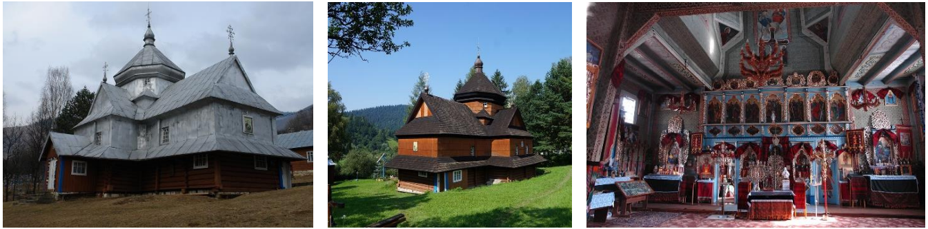
Figure 5. Wooden Maria's Nativity Church of Kryvorivnia. Left: outside appearance before the restoration at the end of 2010. Center: outside appearance after the restoration. Right: the painted interior.

The center of these events is the ancient painted inside wooden Maria's Nativity Church of Kryvorivnia (Fig. 5). It was built in the Kryvorivnia area probably in the 17th century and then transferred to the current location up the hill at the center of the village in 1719 [9]. The Maria's Nativity Church is one of the best regional examples of the Hutsul architectural style of a log-construction church erected over cross elevation with one central opened to the interior dome-tower of "octagon-on-cube" type that shows the possibility of its historic connection with Armenian sacral architecture [10,11,12]. The church is designated as National Cultural Property, but despite this, from the third part of the 20th century the exterior of the church was covered with ugly metal leaves, the cheap but harmful way of damaged roofing repair for wooden constructions. At the end of 2010, due to priest Ivan Rybaruk and community efforts, the church was restored by local carpenters returning it to its original exterior of chopped wooden planks covering the roofing and walls as traditional rain prevention method.