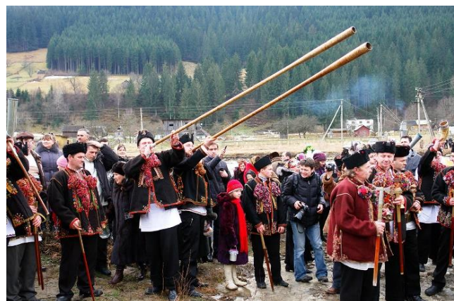
Figure 4. Kryvorivnia's famous Christmas festivals.