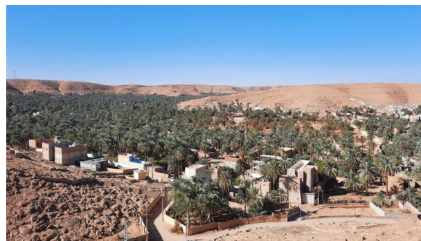
Figure 2. Left: Ksar Melika. Right: the oasis of M'zab Valley.

The architecture in M'zab Valley is simple, but functional and integrated into the environment. It is designed for communal living, within an egalitarian social structure that respects the privacy of the family. This historical richness and heritage diversity allowed the M'zab Valley region to be classified within the National Heritage in 1971. In 1982, it became UNESCO World Heritage registered as an outstanding example