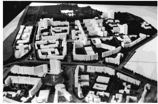
Figure 1. The Outer Neustadt District: a model district reconstruction plan in the GDR (Dresden City General Planning Department Archive, 1988).

environment typical of German cities of the Gründerzeit period. The area has been inhabited since 1800, the main category of which are students and liberal professionals, such as folk crafts artisans, artists, etc. As a result, a heterogeneous cultural environment was formed, which is what makes the neighborhood unique, bringing different functions together, such as ateliers, workshops, stores with handicrafts, etc. (Fig. 2A). To preserve the historical and urbanistic uniqueness of the district, a multi-stage urban regeneration was carried out using a set of planning and legislative tools, with the introduction of a system of "permanent and temporary impulses of development" of the district (Fig. 2B).