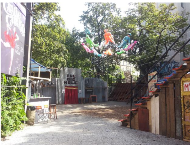
Figure 6. Green spaces designed using improvised materials (2015).

One of the features of the green spaces in the Outer Neustadt district is their "wild" design, made of improvised elements by creative residents, which creates comfort and "creative charm". In the neighborhood, street cafés with gardens, undeveloped areas, and courtyard blocks serve as recreational areas for residents and visitors to the neighborhood. Some of the undeveloped areas have been transformed into playgrounds for children, decorated with wooden elements for children to play (Fig. 6).