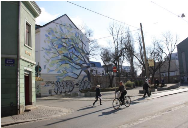
Figure 5. Artistic design of facades on the Alaunstrasse (2013).

The neighborhood's public spaces, colorfully decorated by artists who live in the area, are one of the characteristic features that emphasize the formed "creative Spirit of the place" (Fig. 5) [7].