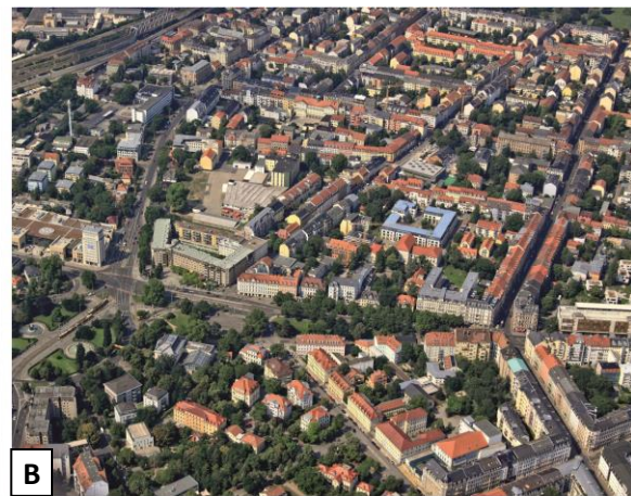
Figure 2. A: Preserved historical urban environment of the Outer Neustadt district in 1932. B: Preserved historical urban environment of the Outer Neustadt district in 2017.