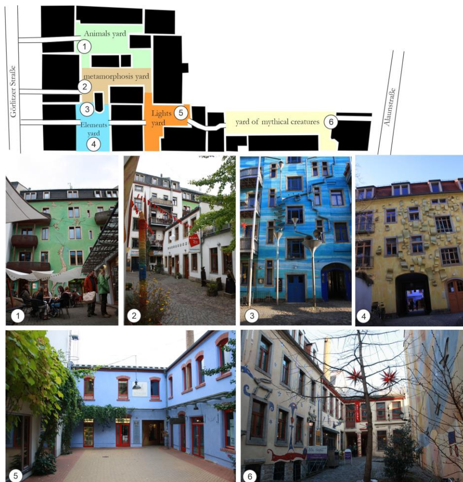
Figure 4. Art Yard Passage: 1 – Animals yard; 2 – Metamorphosis yard; 3 – Elements yard of water; 4 – Elements yard of sun; 5 – Lights yard; 6 – Yard of mythical creatures (2017, drawn/photos by the author).

combining residential, commercial, and public functions emerged. To do so, the residential development was reorganized and a continuous system of public spaces with artistic decoration of the facades was created. The result was 80 condominiums and 20 commercial areas provided for ateliers, workshops, studios, and stores for handicrafts, as well as a playground and a green area. The design of each courtyard is inspired by a particular theme: "animals," "mythical creatures," "metamorphosis," "elements," and "light." The owner was inspired by the ideas of Spanish architect Antonio Gaudi and Austrian architect Friedensreich Hundertwasser and wanted to bring something original and unique to the development of the Schröder Neustadt (Schröder 2019). The project was implemented over a period of about five years from 1997 to 2002. Each courtyard has its own functions: residential, commercial, handmade ateliers, art galleries, and, in addition, small theater performances, exhibitions, fairs and much more are held in the passageway throughout the year. In this way, the Art Passage is a kind of festive space, open all year round (Fig. 4) [1,6].