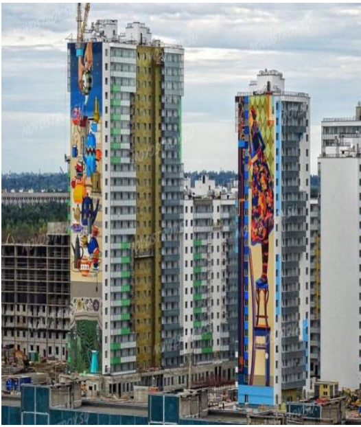
Figure 7. Murals on a typical building (Street Art Festival in St. Petersburg, Russia).

In modern Russian public practice, the mechanism for implementing the ideas of a street artist is a little simpler than in the late Soviet period. But sometimes it is not so easy to get approvals. And even more often, one-time street art actions are artistic statements of protest of a group of interested citizens and city activists. But this is by no means hooliganism, as in early graffiti (especially American) of the 1960s-1970s, but the result of a desire to decorate a house, yard, and neighborhood and transform an entire city. But if the chamber work of a street art artist is performed without proper prior approval, then his fate in the future is uncertain. In some cases, and not only in Russia, the lack of a proper legislative framework confuses both the city services and the artists themselves, who do not know who to negotiate with so that their work remains for a long time and is not destroyed. Currently, in many countries, there are precedents of a more positive attitude towards muralism and street art on the part of the authorities, and the programs of street art festivals are included in urban development programs, which is confirmed by the progress in local legislation.