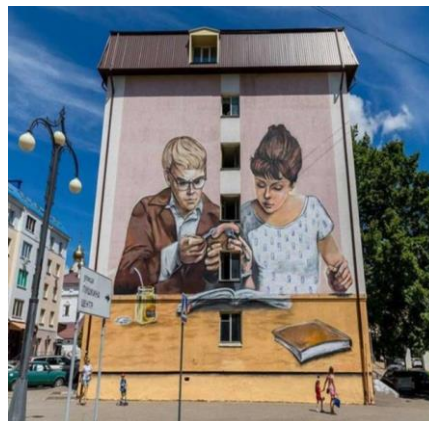
Figure 2. The movie characters of L. Gaidai's film near the Belgorod State University (2020).

Patriotic and educational compositions of street art and thematic murals of similar content are often picked up by local amateurs. Sometimes the initiative comes from the residents themselves and urban enthusiasts are engaged in the tasks of promoting memorable events or important personalities. And their initiatives, as a rule, find a response from the authorities, since they serve the general promotion of individualization and popularization of a particular city, the formation of a local identity. Examples of such activist artists can be found in a variety of countries from China to Latin America.