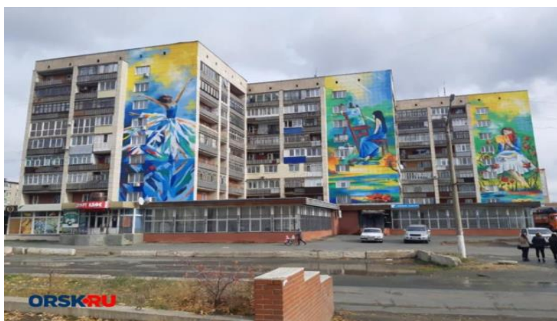
Figure 6. Murals in the residential development of Orsk, Russia (2020).

This method contributes to a greater stylistic and artistic diversity of the transformed urban fragment, which often causes quite notable support from the citizens. Most of the authors of famous murals have a very wide geography of the execution of their plans. Therefore, it is obvious that many street-art artists work in a recognizable author's manner and successfully exploit certain themes or plots, performing variations of their ideas in different cities.