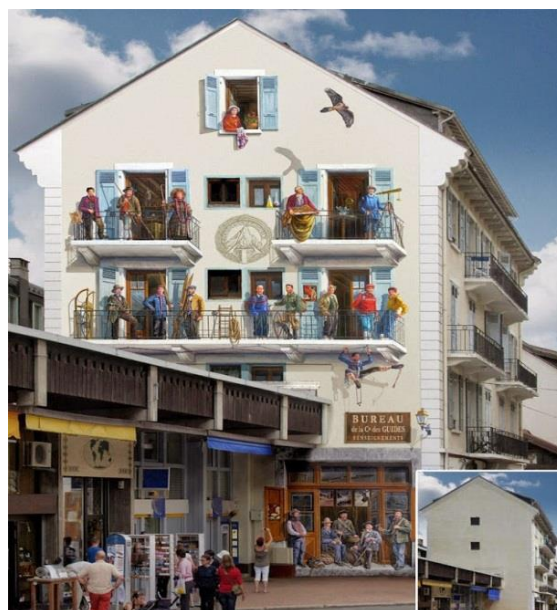
Figure 3. The illusion of "beautification" by Patrick Commesi (Lyon, France).

statement or action. In its figurative effect, the mechanism of "destructive" illusions of street art (Fig. 4) is very close to dramatic Baroque compositions that deformed the calm lines of order architecture or "splashed out" individual figures and objects beyond the graphic boundaries of the designated composition. (In particular, in large-scale murals of the ceilings of the interiors of state halls, etc.)