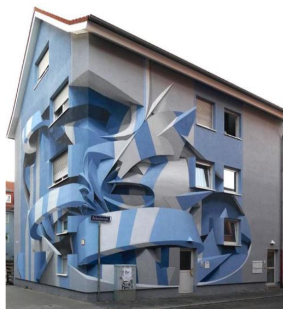
Figure 4. The "Deconstructivist Illusion" by Manuel di Rita (house in Mannheim, Germany).