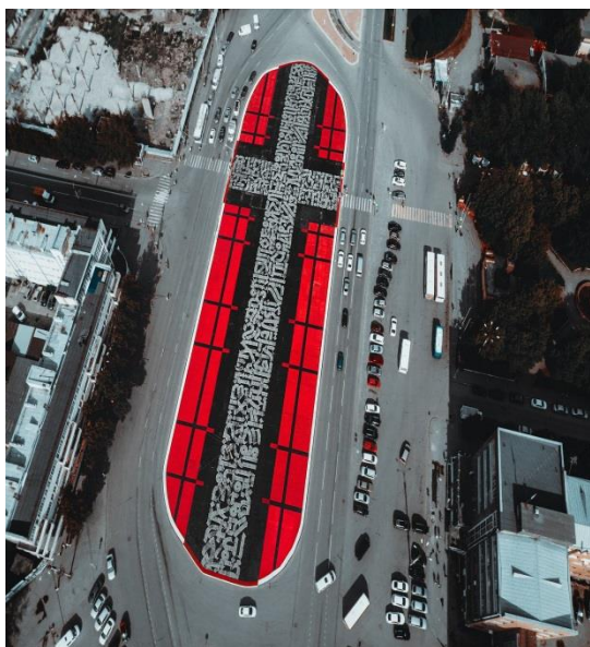
Figure 5. Design of the square in Yekaterinburg (Pokras Lampas, 2018).

To a somewhat lesser extent, lettering occurs in urban muralism, since it is very difficult to build a monumental composition the size of a house only in the technique of reproducing letter modifications of the image. All the more attention should be paid to the works of the Russian street art artist Pokras Lampas, who created a unique author's style ("calligraphiti") on the basis of large-scale lettering [10]. By means of this author's style, the artist forms a new face of giant public spaces, squares and ends of multistorey buildings, placing visual accents in the already established urban environment. His artistic method is akin to the art of medieval Islamic artists who covered the impressive facades and interiors of mosques, madrassas, palaces and tombs of rulers with various ornaments (Fig. 5).